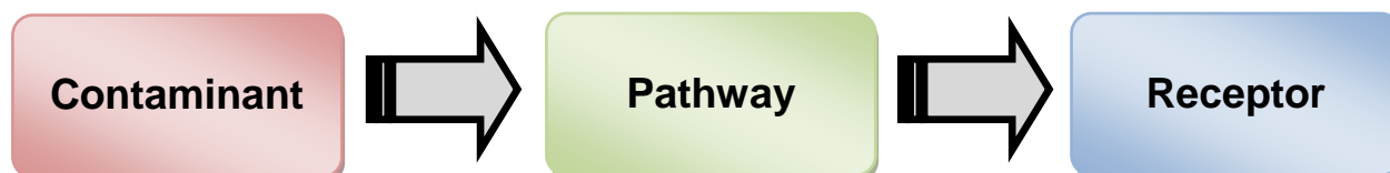
Figure 1.1: Contaminant Linkage

A contaminant is a substance which is in, on or under the land and which has the potential to cause significant harm to a relevant receptor, significant pollution of controlled waters, or harm attributable to radioactivity. Please see Appendix 1 for a list of possible sources of contamination.